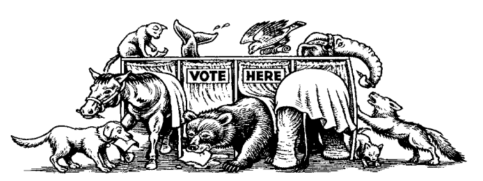
more than to help get animal-friendly legislators, regardless of party, elected.

Some animal-friendly candidates did not win and some were term limited, but in total it still was a good year for many animal-friendly candidates getting elected. Each year the number of responses to our questionnaire has grown, giving us hope that issues affecting animals are working their way into mainstream thinking. MFOA is non-partisan and we do not endorse candidates, but we do very actively encourage our members and supporters to be politically engaged. There is perhaps nothing you can do to help the cause