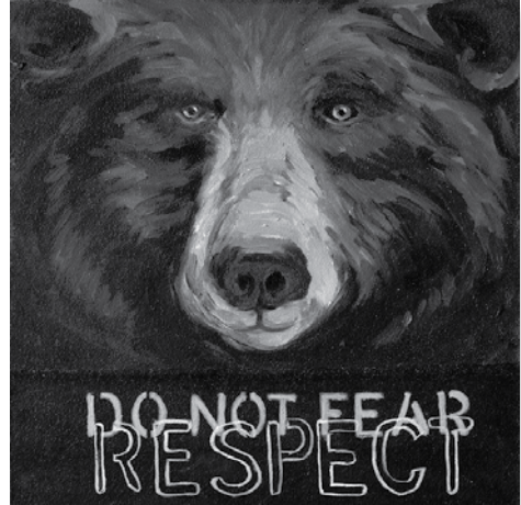
Bear - Respect