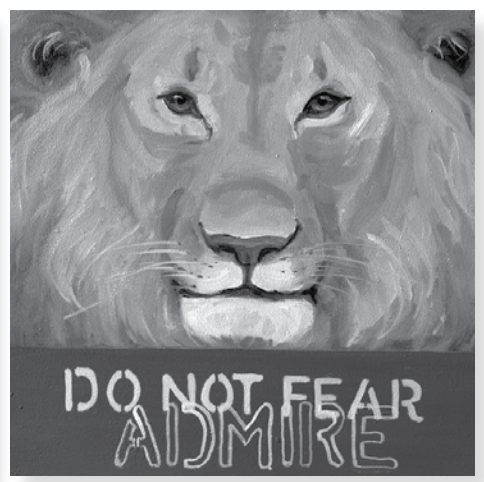
Lion - Admire