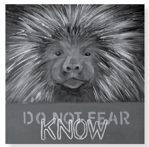
Porcupine - Know