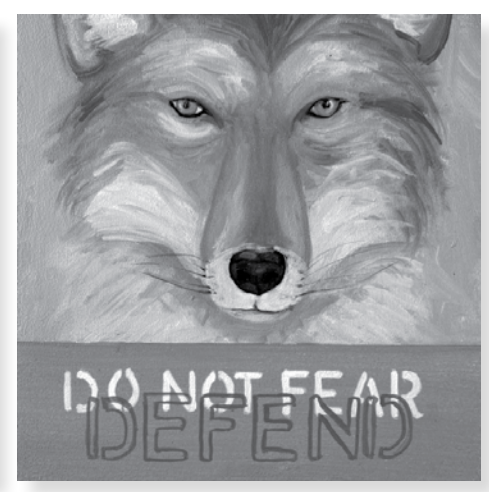
Fox - Defend