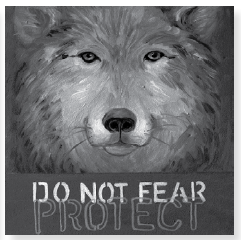
Wolf - Protect