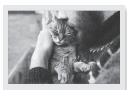
Become a 'MFOA Protector'