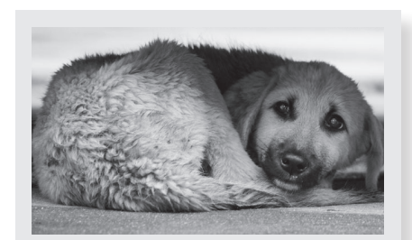
Good legislation is the difference between a warm bed and another night in the cold.